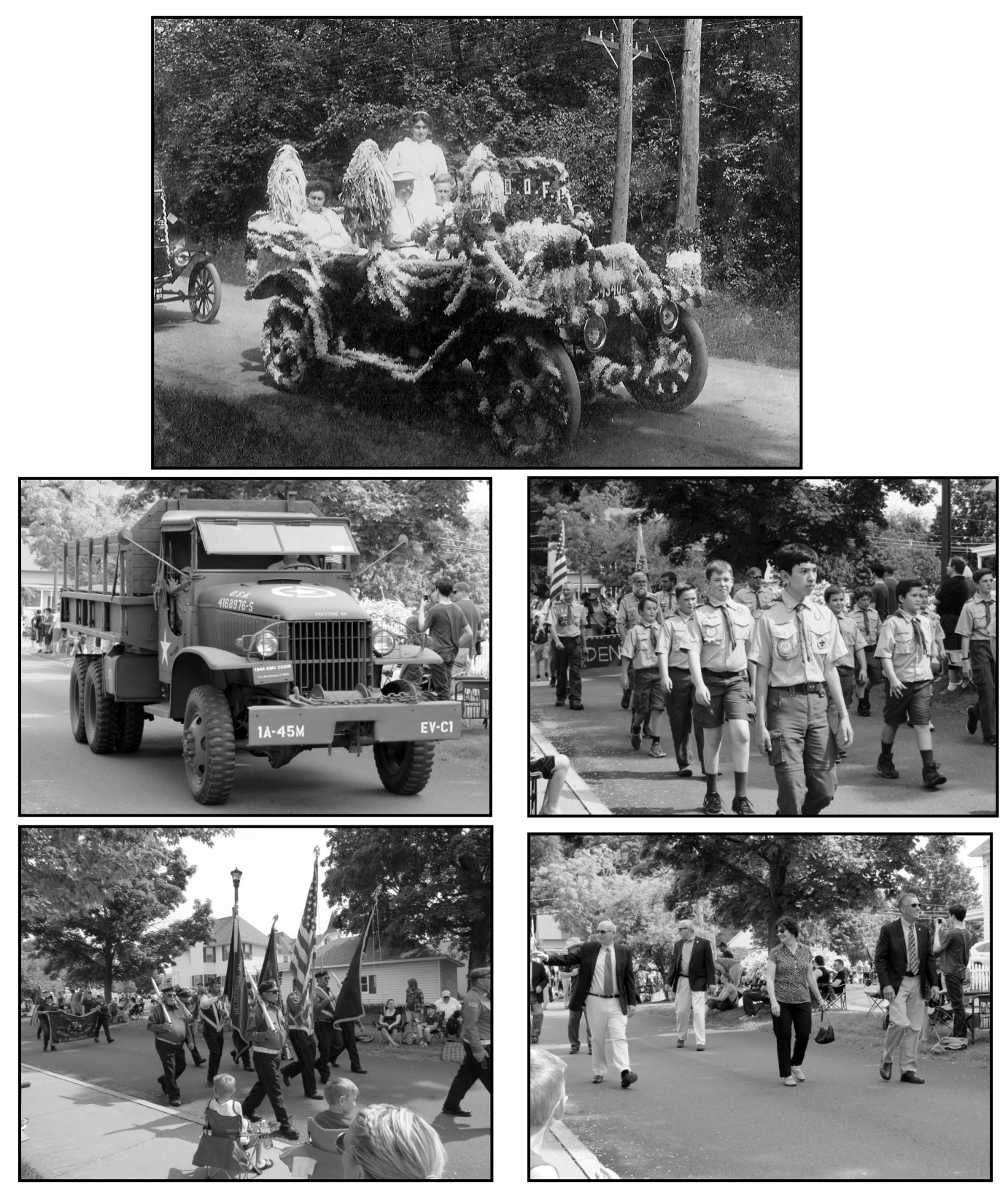
Top Photo: An early version of a parade float made by the International Order of Odd Fellows Below: Photos from Voorheesville Memorial Day Parade 2018

MUSEUM UPDATE The Museum will be closed until early July while volunteers update the exhibit.