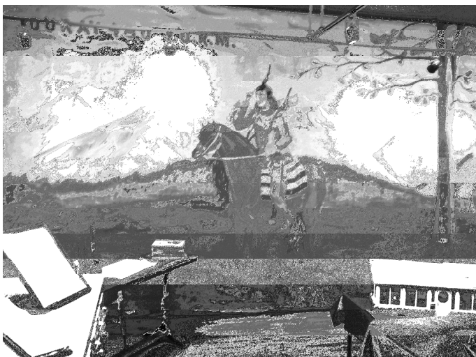
Our recently acquired Redmen Banner from New Salem's own Ouray Tribe is on exhibit.