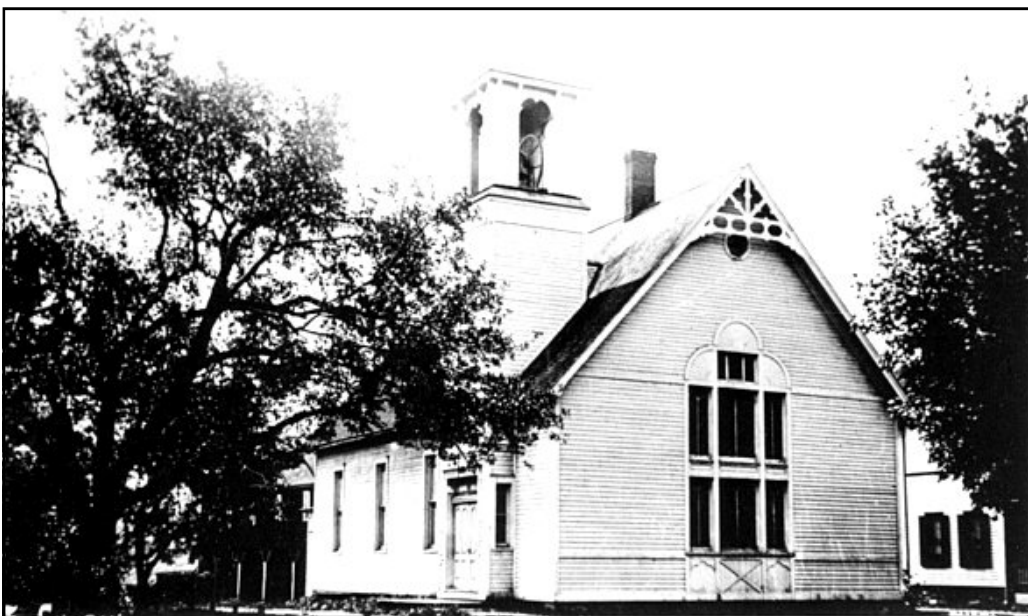
Voorheesville Methodist Church with carriage shed in the rear c. 1915.

Over the ensuing decades, this congregation has gradually grown in numbers, keeping pace with the surrounding community. Hence, the physical size of the current church complex is evidence of a continuing need to expand. The most recent addition (office, parlor, and first floor nursery) was dedicated at a Service of Consecration conducted by Bishop Susan Morri-