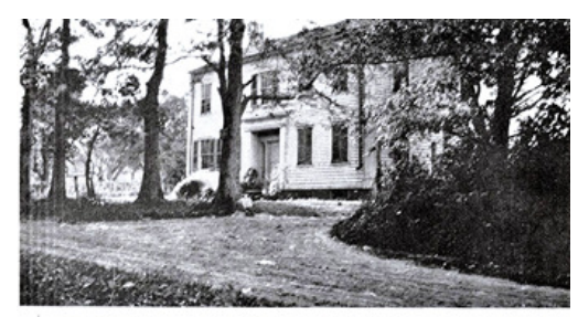
THE FIRST CAMP AT INDIAN LADDER Our first year of camp in 1898

I wonder how many of our members attended Camp Pinnacle and if they knew it was the first girl's camp in the United States and possibly the world. The camp's first year was 1898 and it was held in half of the farmhouse pictured above. This home was located in Thacher Park near where the old swimming pool was. You reached it by coming up the old road which started from the Altamont Road near the home now owned by the Anderson family and the old Meadowdale train station.