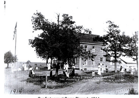
camp seen from Pinnacle Road