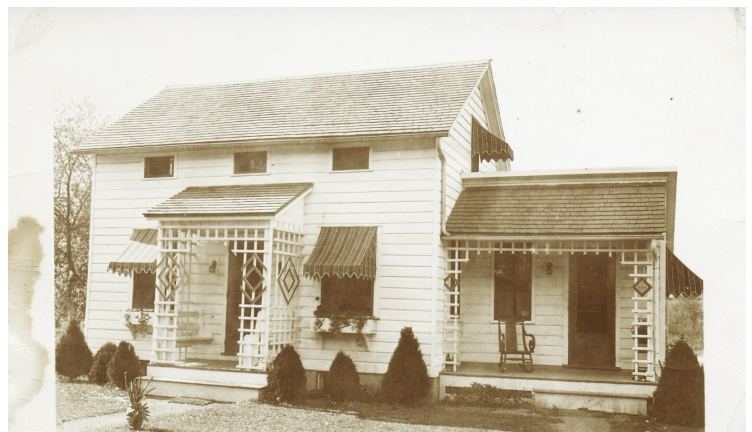
Another view of the Kuhn house after renovation