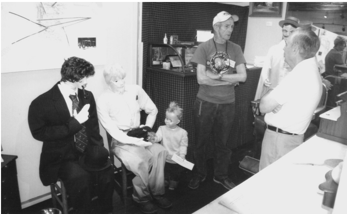
People waiting their turn in the barbershop exhibit

Sandy Z. Slingerland, Exhibits Chairperson